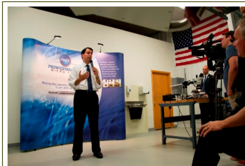
Wisconsin Governor Scott Walker addresses Performance Micro Tool staff on Sept. 18.